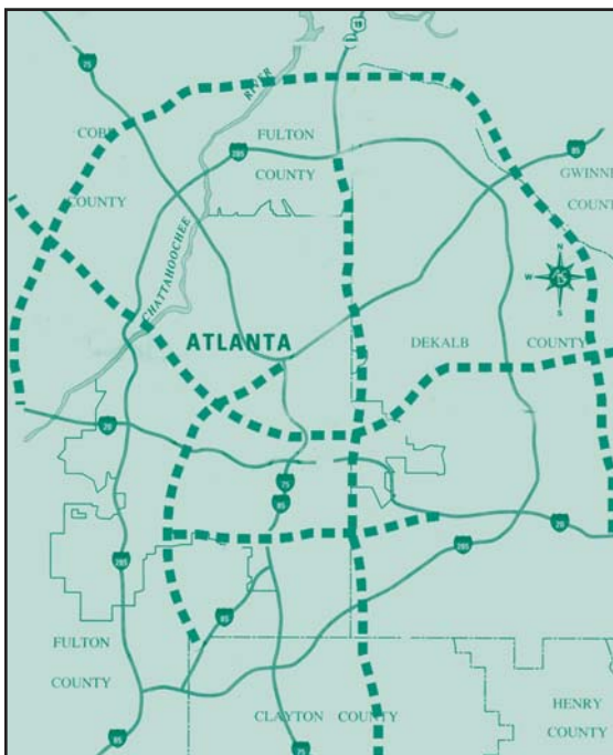
PROPOSED FREEWAYS for ATLANTA (dotted lines).

ued, only now it accelerated in traditional residential neighborhoods drained by “white flight” and burgeoning suburbs. Neighborhoods like Ansley Park, Morningside, what we now call Virginia Highland (although it had no neighborhood designation then), Inman Park, and Candler Park were faced with declining property values, increasing multi-family housing, and flat or negative population growth. One city planning document in the early Sixties wrote off the intown neighborhoods, labeling them “decaying” urban areas, saying it would be a waste of city, state, and federal funds to invest in future development there.